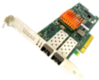
Figure 1 – The high-performance, dual-port Chelsio T420-LL-CR 10GbE Unified Wire Adapter

Moreover, the Chelsio dual-port 10GbE adapter can handle messaging at full wire rate with 256 byte packets typical to HFT environments, guaranteeing no update or trade is lost.